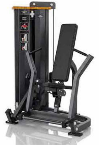
Graphite Black Frame Graphite Black Arm