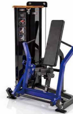
Piano Black Frame Ocean Blue Arm