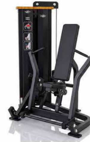
Matte Black Frame Matte Black Arm