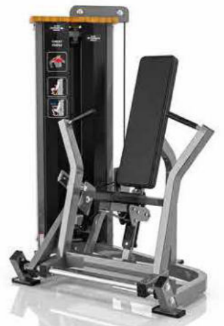
Titanium Grey Frame Titanium Grey Arm