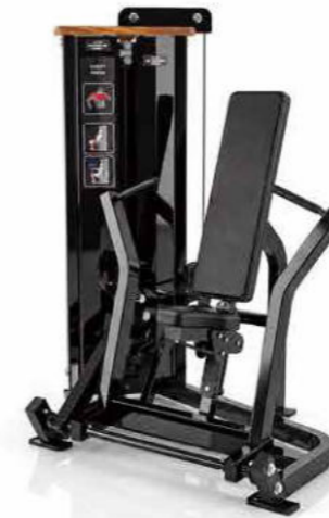
Piano Black Frame Piano Black Arm