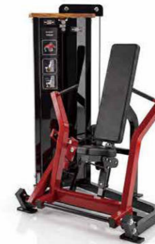
Piano Black Frame Performance Red Arm